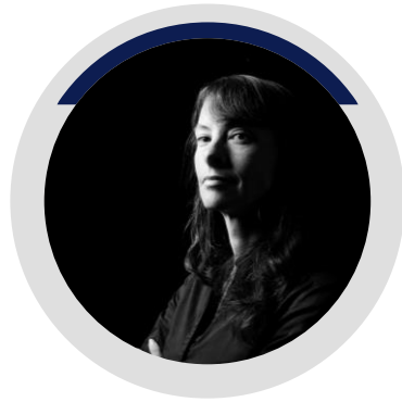
PROF TANYA WYATT

Deforestation – from fashion to food to furniture