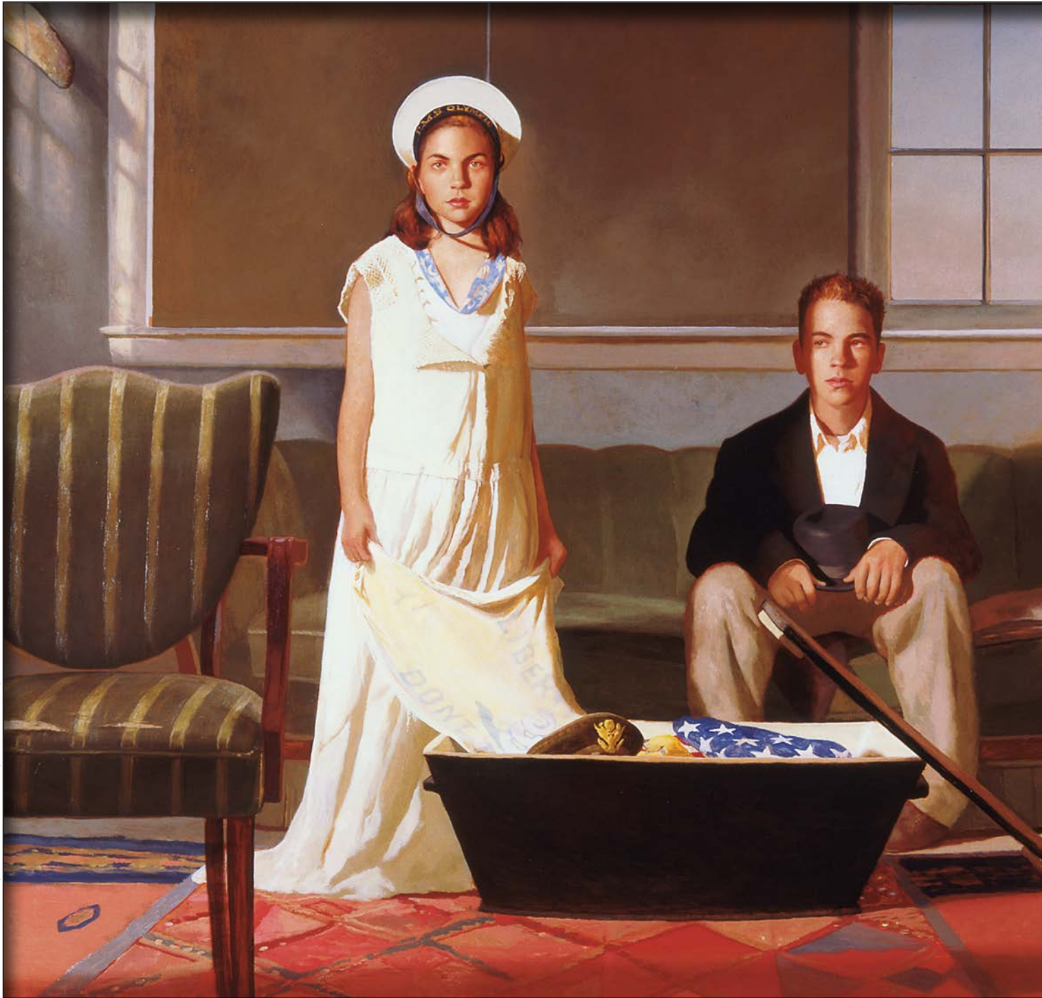
PAINTING / BO BARTLETT, THE BOX. OIL ON LINEN, 82 x 100 INCHES, 2002.