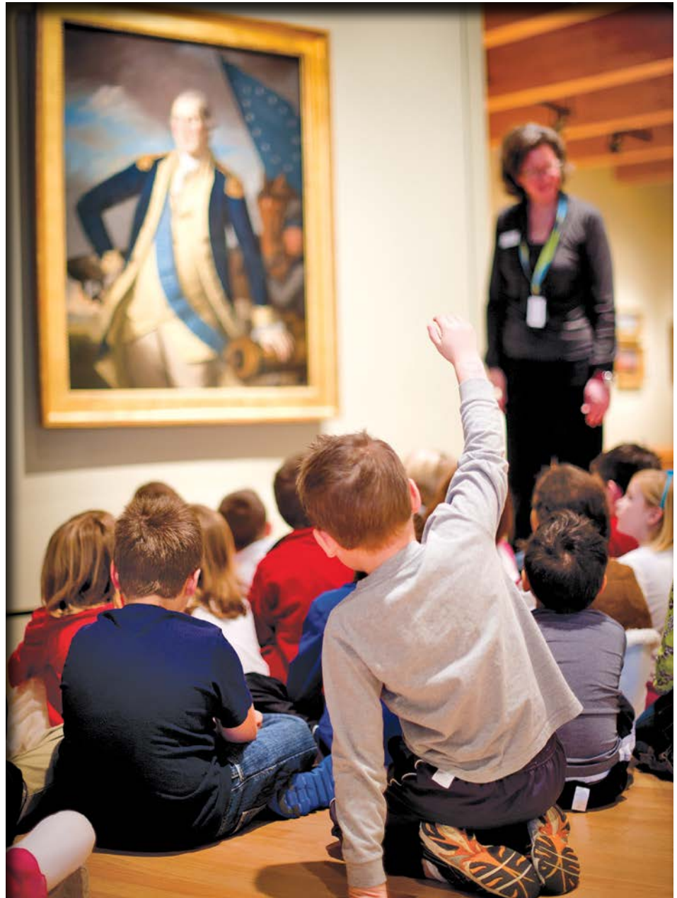
A museum educator discusses the painting George Washington by Charles Willson Peale with kindergarten students.

This first-ever, large-scale, random-assignment experiment of the effects of school tours of an art museum should help inform the thinking of school administrators, educators, policymakers, and philanthropists. Policymakers should consider these results when deciding whether schools have sufficient resources and appropriate policy guidance to take their students on tours of cultural institutions. School administrators should give thought to these results when deciding whether to use their resources and time for these tours. And philanthropists should weigh these results when deciding