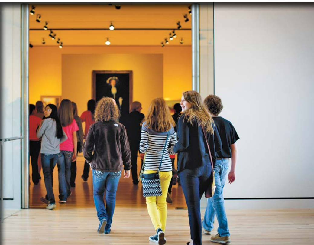
Eighth-grade students on tour enter the exhibit Focus: The Portrait, Picturing Women at the Turn of the Twentieth Century. Robert Henri's Jessica Penn in Black with White Plumes hangs on the far wall.

a brief description only when students requested it. This format is now the norm in school tours of art museums. The aversion to having museum educators provide information about works of art is motivated in part by progressive education theories and by a conviction among many in museum education that students retain very little factual information from their tours.