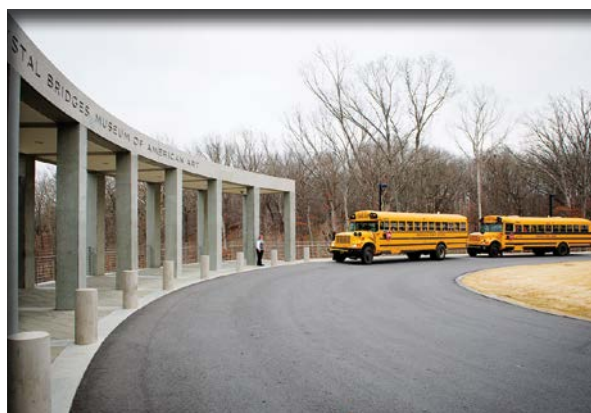
During the first two semesters of the school tour program at Crystal Bridges, the museum received 525 applications.

cancel compared to 32 percent of the treatment-group students. These differences are not huge, but neither is the intervention. These changes represent the realistic improvement in tolerance that results from a half-day experience at an art museum.