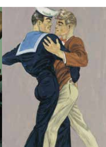
© Tom of Finland Foundation LA