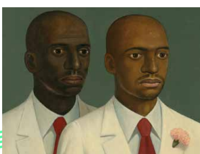
White Wedding (2006) © John Kirby, courtesy of Flowers, London