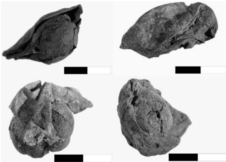
Figure 3. Charred 'wine pressings' from Late Neolithic Dikili Tash (detail of four specimens; scale: 5mm).