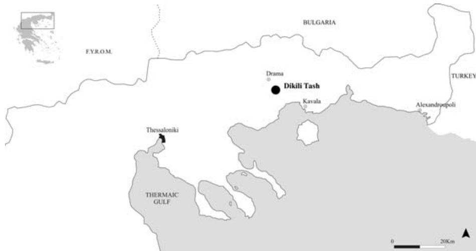
Figure 1. Map of northern Greece indicating location of Dikili Tash.

(N.C.S.R. Demokritos, Laboratory of Archaeometry (Y. Maniatis, G. Fakorellis), sample DEM 179; calibrated following Stuiver & Reimer 1993, Stuiver et al. 1998). They originate from the southern area of the house and consist of a total of 2460 grape pips and a large number (more than 300) of empty, pressed grape skins occasionally attached to grape pips (Figures 2 & 3). Measurements carried out on the grape pips from House 1 at Dikili Tash suggest that the grapes used at the site were morphologically wild (Mangafa & Kotsakis 1996). Two possibilities seem plausible for the House 1, Dikili Tash grapes: they were either harvested from wild plants or they originated from plants at a very early stage of tending or cultivation (before the development of pips bearing the morphological characteristics of domestication). The region of the Drama plain is within the geographical distribution of the wild vine, V. vinifera sylvestris (Logothetis 1962) and has been detected in pollen profiles from the Drama plain, in the vicinity of Dikili Tash, between 13 000-10 000 BP (Wijmstra 1969). Grape pollen has been found in various locations in northern Greece with an increasing, but spatially and temporally discontinuous, presence since the beginning of the Holocene. There is a significant rise from 3500 BP onwards, the increase being related to human activity and the cultivation of the grape vine (Bottema 1982).