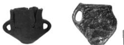
Figure 4. Cups from Final Neolithic Dikili Tash: a) two-handled cup from House 1 (height: 16cm), b) one-handled cup from House 4 (scale: 2cm).

show whether juice/wine from wild or domesticated grapes was included in the vessels where tartaric acid has been found. Secondly the finds lend support to earlier views that wine production, viticulture and the domestication of the grape vine could have taken place independently in various parts within the broad region of the grape vine's natural distribution, northern Greece being one of them, rather than in one region such as the Near East (Zohary 1995) and Anatolia or the Caspian (Olmo 1995). The assemblage from the Neolithic houses of Dikili Tash includes two-handled cups and jars that suggest a use for decanting and consuming liquids (Figure 4). Later on, the pottery