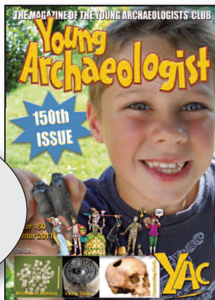
Tony Robinson Time Team

YAC encourages young people to look after and protect our archaeology. I am proud to be YAC's President!