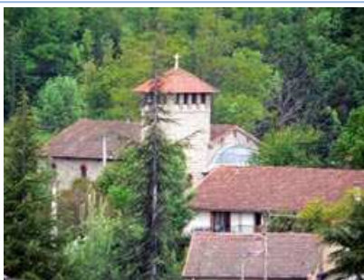
The "English" church and the monument to the "Entente Cordiale"

During his 1911 visit to Vernet, Kipling wrote a letter to the Alpine Club of France about the nearby mountain called Canigou, which rises to over 9,000 feet. He praised it as "a magician among mountains" which he watched "with wonder and delight". In the same month (March) Kipling also wrote a light-hearted short story entitled Why Snow Falls at Vernet . It makes fun of the English habit of talking about nothing except the weather.