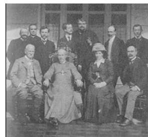
Kipling (bottom, far right) with a group of dignitaries in Vernet, 1911

For more detailed information please visit the Vernet-les-Bains website at www.vernet-les-bains.fr/vernet/english.asp