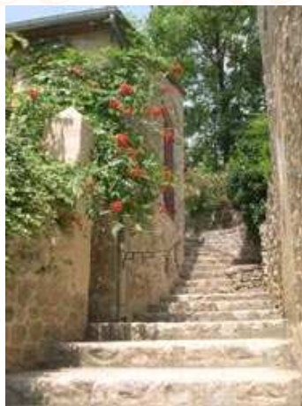
Vernet-les-Bains, the old village