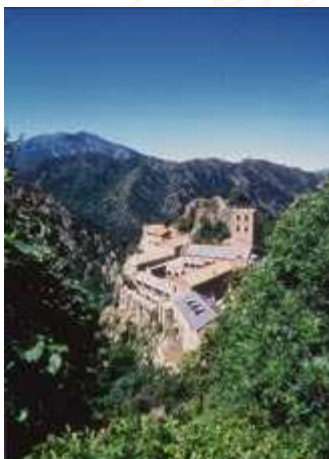
The abbey of St Martin du Canigou

Vernet-les-Bains is enchanting: a village which is a delight to visit, whatever the time of the year and whatever your preferred pace of discovery.