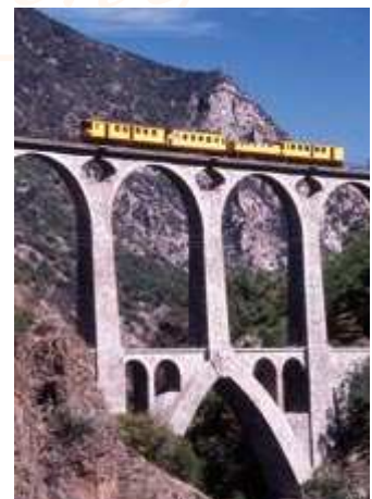
The "little yellow train"

For more detailed information please visit the Vernet-les-Bains website at www.vernet-les-bains.fr/vernet/english.asp