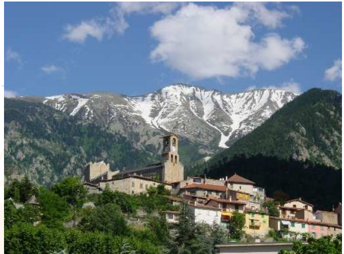
Vernet-les-Bains and Canigou

Kipling (far right) in front of the Hôtel Portugal, with his signature from the hotel's visitor's book