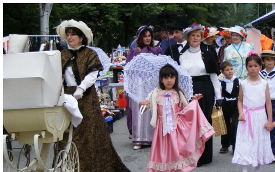
The "Fête de la Belle Epoque"

Throughout the year, events and entertainments traditionally held in Vernet will adopt Kipling-related themes. The town's carnival will be based on the "Jungle Book". And the town's great spring festival - the Fête de la Belle Epoque , a long weekend of open-air historic reconstructions, entertainments and much dressing-up in period costumes - will give pride of place to Kipling's charming tale, "Why Snow Falls at Vernet".