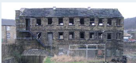
Keighley Low Mills

The historic environment is under threat from many directions, not least budgetary constraints. This means that whatever we do to protect it will have to be firmly prioritised to ensure that our resources