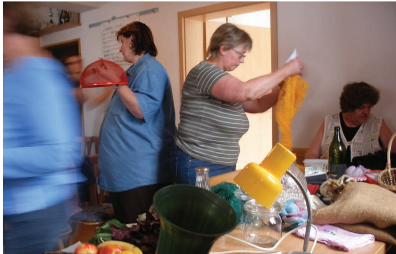
myvillages.org International Village Shop