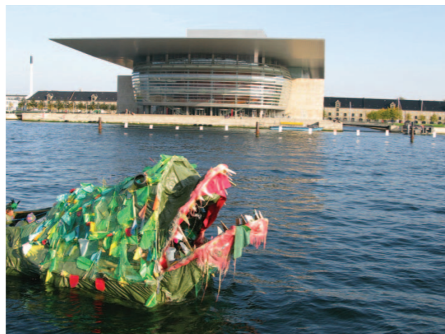
Parfyme Harbor Laboratory 2008