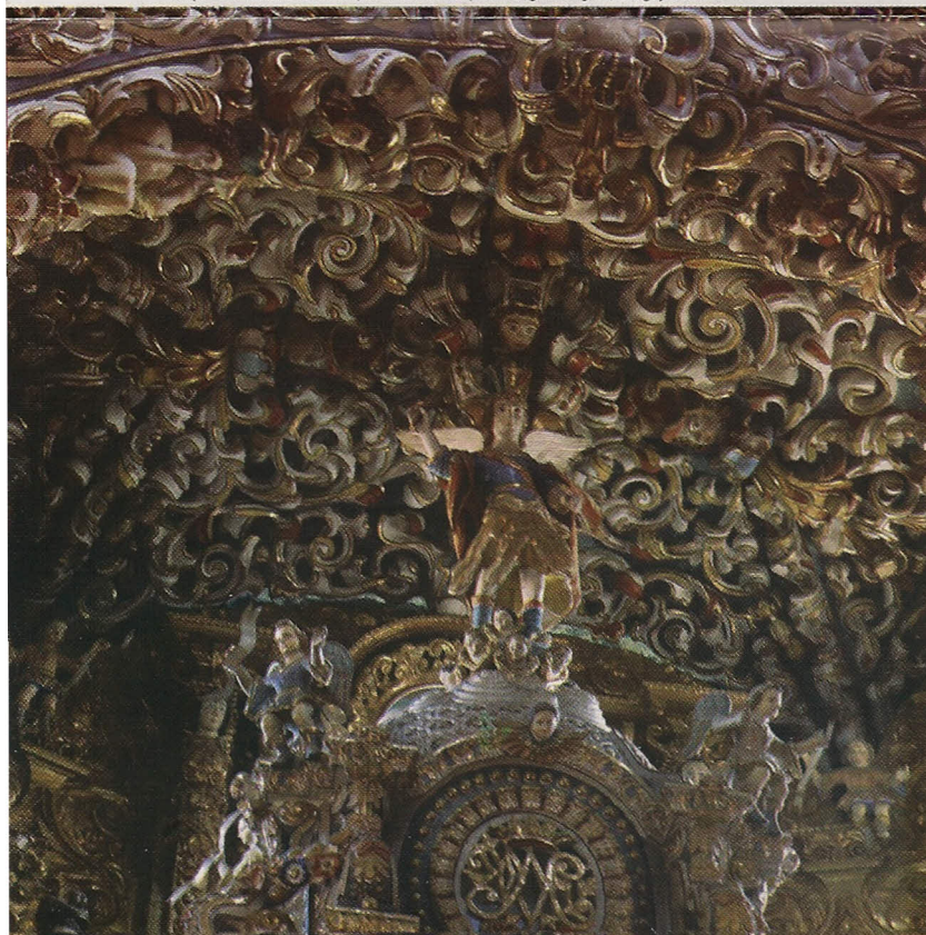
Templo de Santa María Tonantzintla, San Andrés Cholula, Pue.