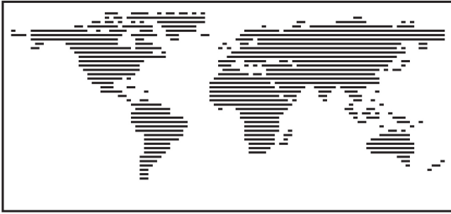
Detanico Lain (The World) Justified, Left-Aligned, Centred, Right-Aligned, 2004 Courtesy the artists