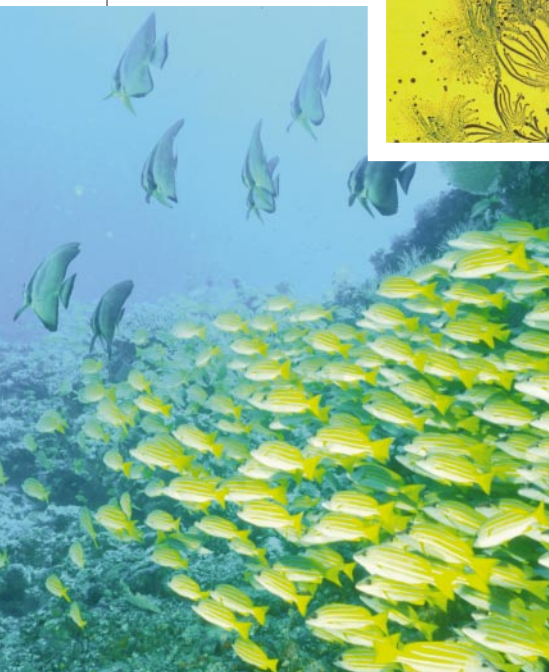
All together now: collective behaviour can readily be seen in fish and bacteria (inset).