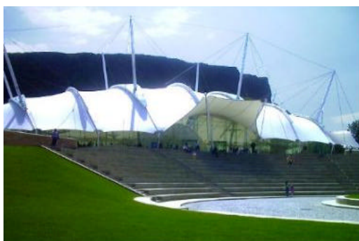
Dynamic Earth – This attraction has a "time machine" that whisks you from the time of the "Big Bang" and the formation of the universe, through