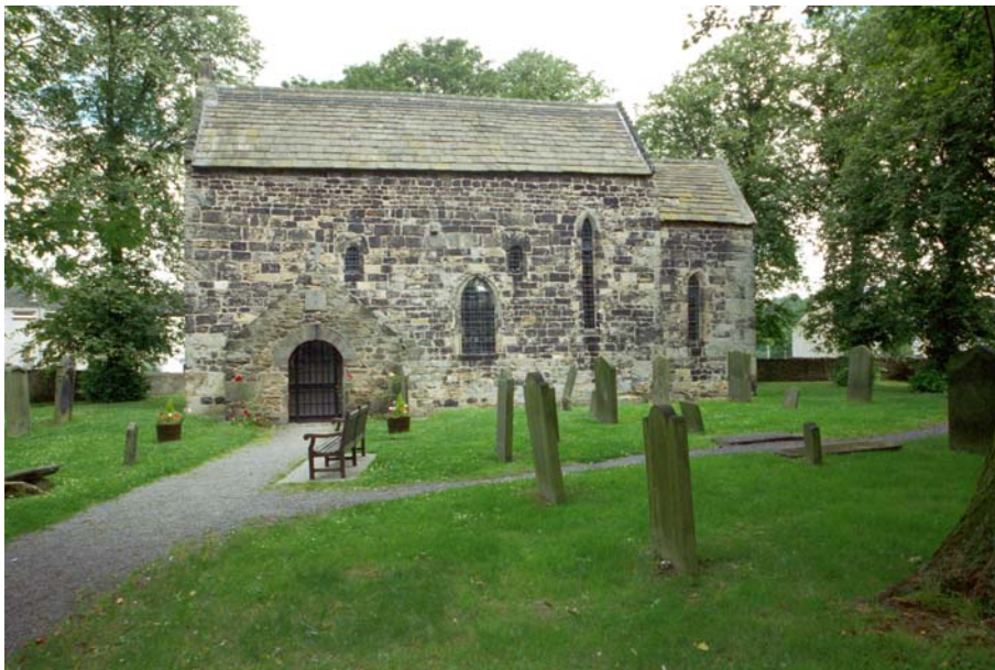
© Mr Brain Wilkinson. Source English Heritage