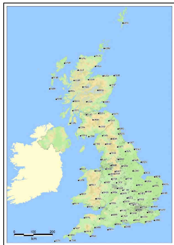
Fig. 1 OS Net GNSS Network

A complete receiver upgrade is being rolled out and, as of June 2018, is 50% complete. When complete half the network will be equipped with Septentrio PolarX5 receivers and the other half will be Trimble Alloy receivers. The receiver types will be mixed evenly across the whole network to