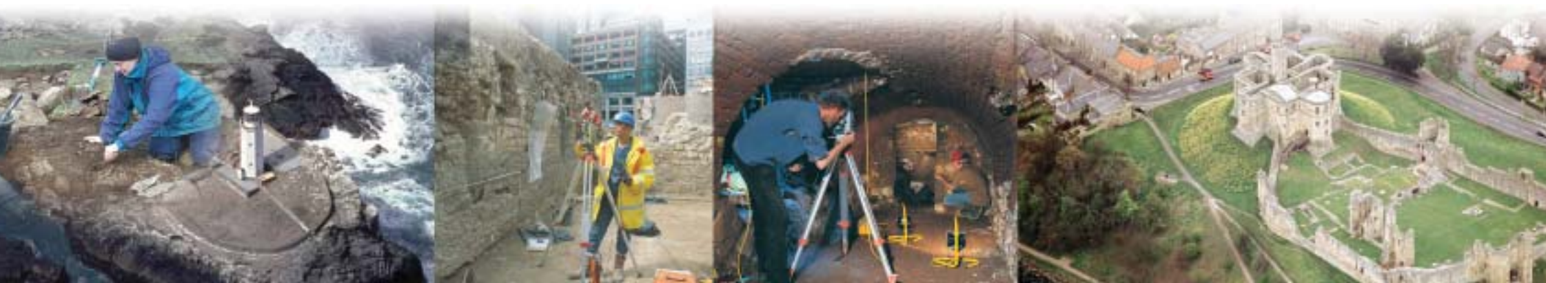
This poster was funded by the kind donations of the following organisations: